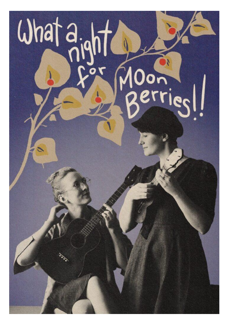
... discover more at: <a href="https://sageharrington.com/">https://sageharrington.com/</a> <a href="https://www.moonberriesswing.com/">https://www.moonberriesswing.com/</a>

"Moon Berries" are fruits dipped in moonlight that are used for flavouring and the consumption of which is intoxicating. We can promise: These moon berries are definitely exhilarating and guaranteed to make you happy - legally and without any headache.